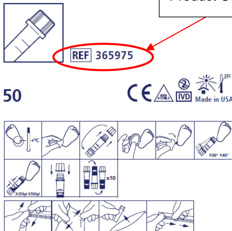
Shelf Carton Example