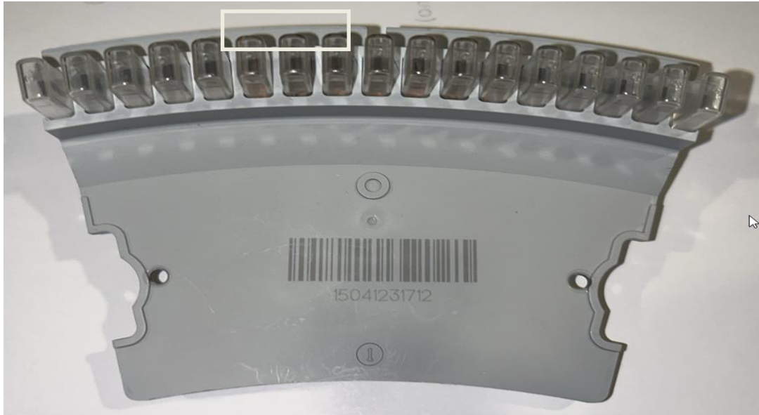
Figure 1. Location of the lot number on Atellica CH Reaction Ring Cuvette Segment