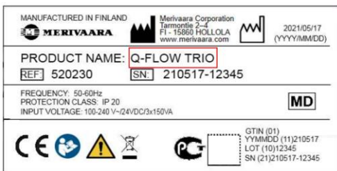
Figure 1. Example of the device's type plate

This urgent Field Safety Notice concerns the above listed Merivaara Q-Flow lights manufactured before June 2023 . The manufacturer and model of the surgical light can be checked from the type plate attached to the device, see Figure below.