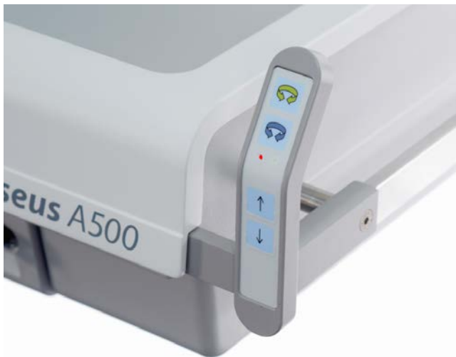
Picture 2 Movita Lift / Lift Strong