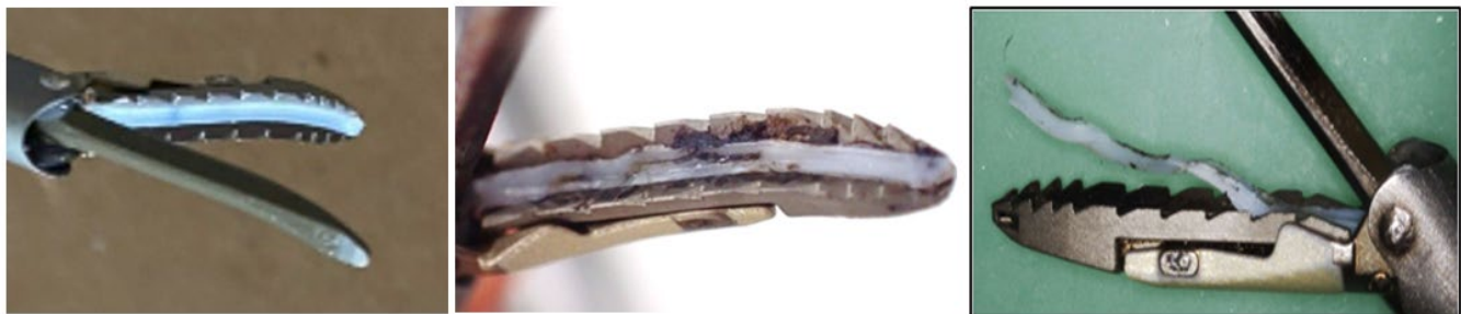
Figure 2. Example of Thunderbeat Probe in accordance with specifications (Left), Tissue Pad Deformation (Center), Tissue Pad Detachment (Right)