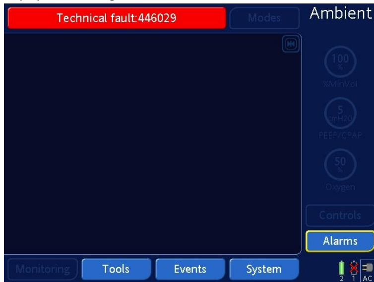
Figure 1: The display indicates “Ambient State”, and a red message with a Technical Fault number (example, a different Technical Fault number might be displayed)

During the “Ambient State” the ventilator will alarm audibly and visually and display the following on the screen: